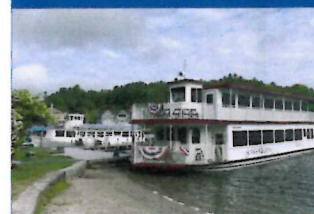
Scenic Narrated Cruise on Lake Sunapee

Departure: O'Fallon YMCA, 284 N. Seven Hills Rd, O'Fallon, IL @ 8 am