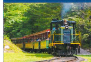
Enjoy a Fun Train Ride