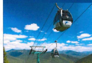
Experience a 1.3 Mile Scenic Gondola Ride