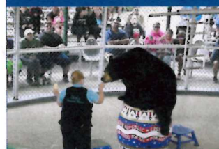
See a Live Bear Show