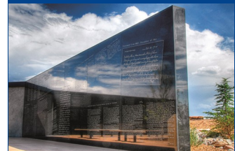
New Mexico Veterans' Memorial