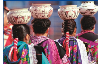
Native Southwestern Culture and Crafts