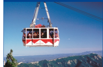
Breathtaking Views of the Sandia Mountains