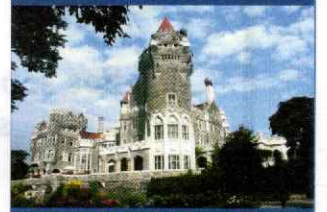
Magnificent Casa Loma Castle in Toronto