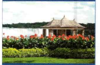
Visit beautiful Queen Victoria Park