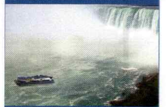
Experience the mighty Niagara Falls