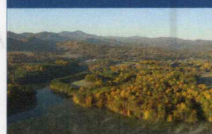
View the Blue Ridge Mountains.

Day 6: Today after enjoying a Continental Breakfast, you depart for home... A perfect time to chat with your friends about all the fun things you've done, the spectacular sights you've seen and where your next group trip will take you!