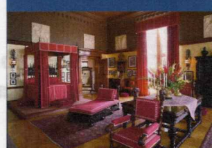
Grand Victorian architecture.