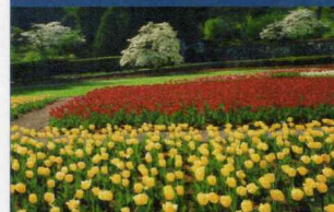
One of the Biltmore's many gardens.