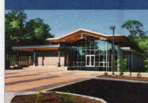
The Blue Ridge Parkway Visitor Center.