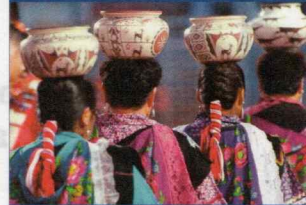
Native Southwestern Culture and Crafts