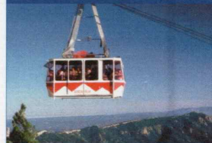
Breathtaking Views of the Sandia Mountains