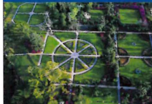
Visit Middleton Place and Gardens