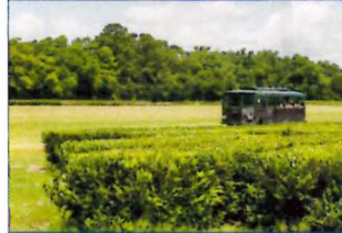
Tour Charleston Tea Gardens