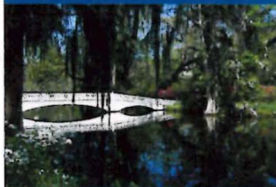
Take in the Picturesque Views of Charleston

Day 7: Enjoy a Continental Breakfast before departing for home... a perfect time to chat with your friends about all the fun things you've done, the great sights you've seen and where your next group trip will take you!