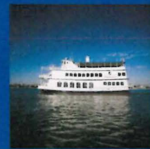
Cruise Around Charleston Harbor