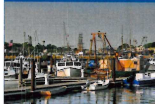
Historic Gloucester "America's Oldest Seaport"