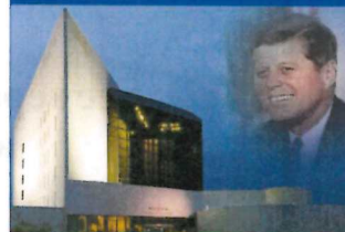
JFK Library & Museum