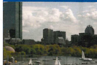
A Guided Tour of Boston

Day 9: Today, after enjoying Continental Breakfast, you depart for home... a perfect time to chat with your friends about all the fun things you have done, the great sights you have seen, and where your next group trip will take you!