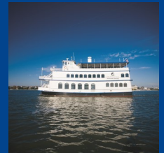
Cruise Around Charleston Harbor