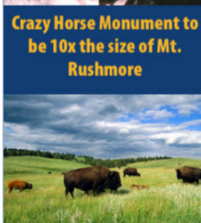
Wildlife enhances the pristine Black Hills