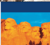
U.S. Presidents immortalized in stone at Mt. Rushmore

$75 Due Upon Signing. *Price per person, based on double occupancy. Add $209 for single occupancy. Final Payment Due: 7/8/2024