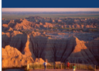
Spectacular Badlands National Park