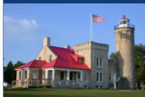
Mackinac Point Lighthouse