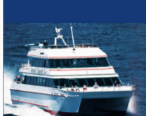
Mackinac Island Ferry