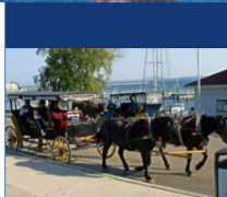
Tour Mackinac Island by Horse and Carriage

Day 6: Today you'll enjoy a Continental Breakfast and depart for home... a perfect time to chat with your friends about all the fun things you've done, the great sights you've seen and where your next group trip will take you!