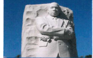
Martin Luther King, Jr. National Memorial