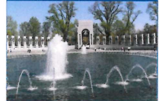
World War II Memorial