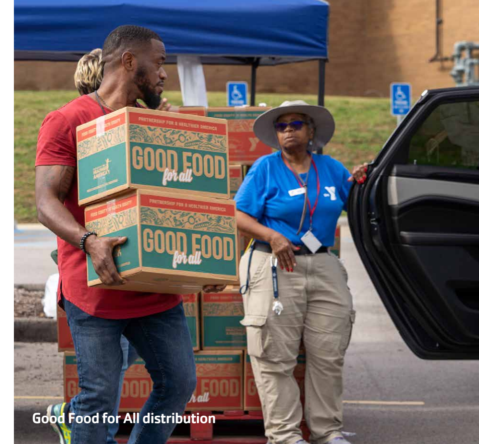
Good Food for All distribution

506 college students participated in 23 active programs with 37 community partners providing support to the St. Louis community through blood drives, educational enrichment, tutoring, and mentoring youth.